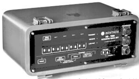
Optional DS 7000 Deck Unit